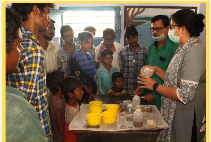
Workshop and lecture demonstration on organic dye making from natural materials and dyeing techniques at Bharatpur.