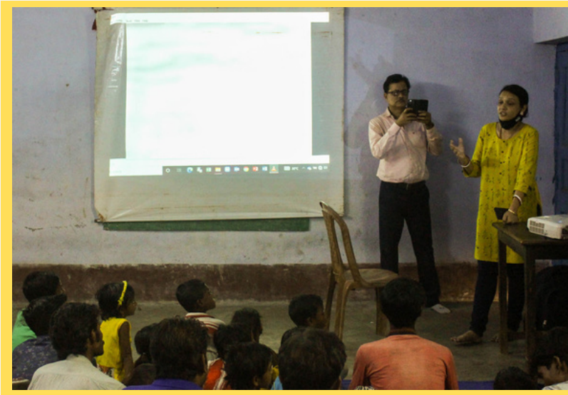
Documentary film screening at Bharatpur on indigo cultivation and extraction of dye from it.