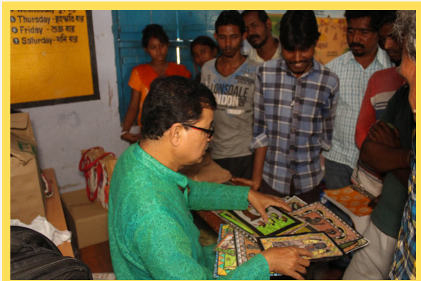
The two-day camp provides skill building training to the artists on how to create a permanent natural color and encourages them to use natural materials to make their artwork.